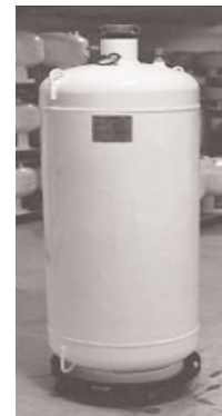
Series 70 Clean Agent Containers