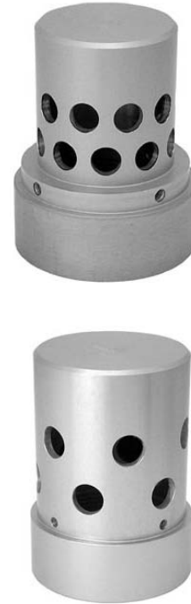
Fike Engineered Nozzles

The nozzle used to disperse Clean Agent shall be a Fike Series 80. The nozzle shall be available in 3/8" (10mm) thru 2" (50mm) sizes. Each size shall be available in both 180 and 360 degree dispersion patterns. The nozzle used shall have pipe threads that correspond to the nozzle size. All nozzles shall have an orifice size determined by a UL listed and FM approved flow calculation program. All nozzle orifice drilling shall be performed by the manufacturer or a UL listed nozzle drilling facility.