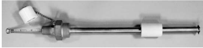
Liquid Level Indicator

The Fike 70-1353 series Liquid Level Indicator is a simple manually operated device which provides a means to determine the Clean Agent liquid level in vertically mounted agent storage containers. Once the liquid level is determined, it can then be converted into pounds (kilograms) of Clean Agent present in the agent storage container. (Refer to Fike HFC-227ea Instruction Manual for Liquid Level Indicator (LLi), P/N 06-107.)